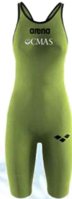
- Carbon PRO Closed back - Carbon PRO Open back